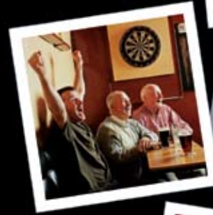
Support one another