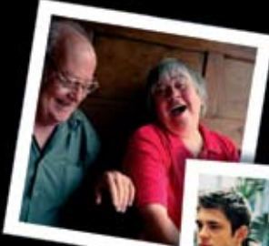
Laugh out loud