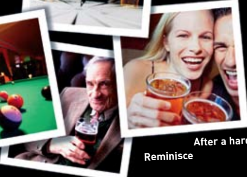
After a hard day Reminisce